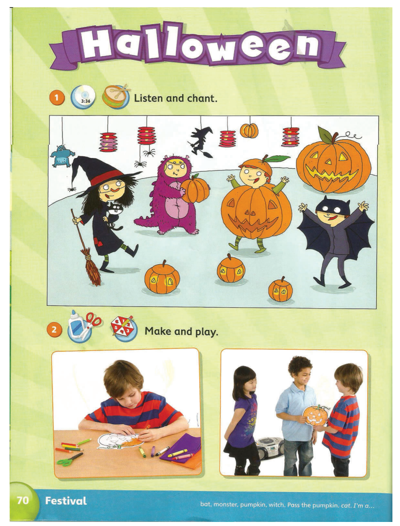
Figure 4. Example of complementarity in CB1 (Our Discovery Island 1, p. 70).

The category of complementarity related to the image-language supplement which is described by augmentation (when the image extends the text or the text extends the image) and divergence. The example of the image which extends the text is shown in Figure 4 below.