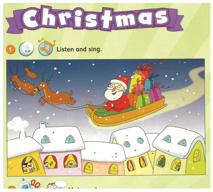
Figure 1. Example of clarification in CB1 (Our Discovery Island 1, p. 71)

A rapid increase is observed in the core mode of language through the verbal input provided in the cultural sections for the third year. The data collected for the median variant of speech recorded and the median variant of state writing are the same. The results confirm the move from the oral resources of communication towards the written ones. Finally, the core mode of sound, which is related to soundtracks of sentences, stories, and songs, is realized through either five or six soundtracks per each cultural section. The details indicate its steady role in the cultural content across grade 1, 2, and 3. To compare the details depicted in Table 2, the core mode of music in Table 4 is also realized through two songs in CB1 and CB3. Continually, CB2 does not include any songs in the cultural content.