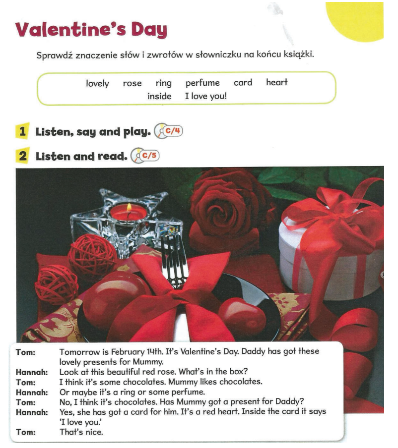
Figure 3 . Example of exemplification in CB3 (Our World 3, p. 117).

Correspondingly, the subcategory of exemplification offers two possibilities. The first one is defined here by the image which serves as an example from the text. The second possibility occurs when the text includes an example of what is mostly depicted in the image which is shown in Figure 3.