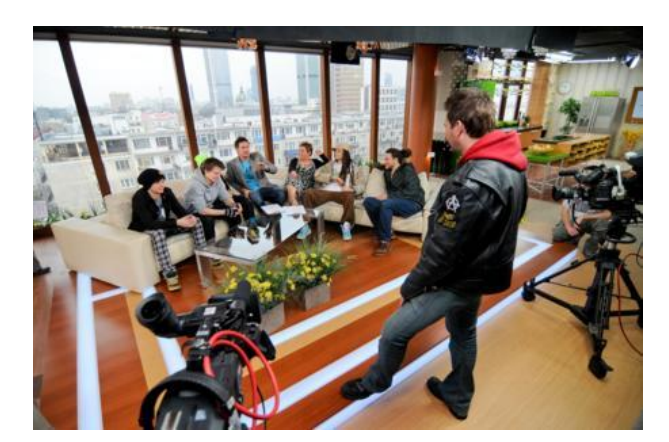
B-27 (the same line-up as Blog 27 ) visiting the Good Morning TVN show, Source: TV/Fabryka obrazu (Picture factory), Ostatni klaps na planie serialu "39 i pól" ,