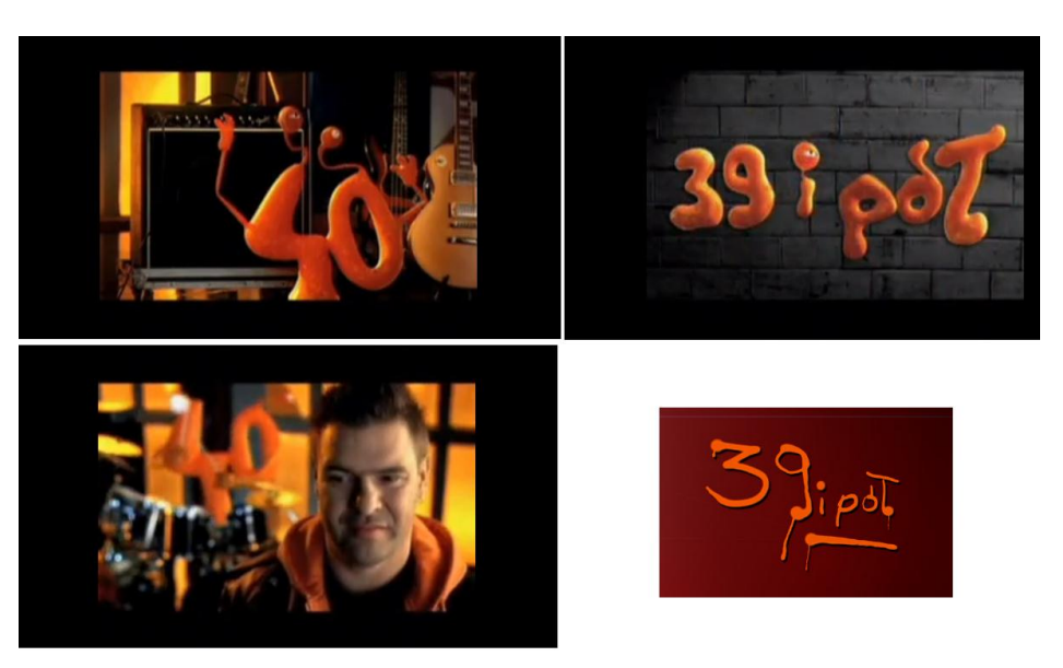
Clips from the first advertisement 39,50zl. Mobilny Internet Orange Free, Source: stills from the spot. Bottom—right: 39 and a half official logo, Source: print screen of http://39ipol.plejada.pl/.

Orange's presence throughout the series, achieved using product placement, and its location on the show's website as the official sponsor are used to strengthen brand identification with the television production. These identifications are created through using similar design (e.g., the hero image, a similar logo), and above all, using the theme of "escaping" from the number 40. By representing the show's main character in these advertisements, his image has become stronger; in particular, his appearance, passion, and personality have been reinforced.