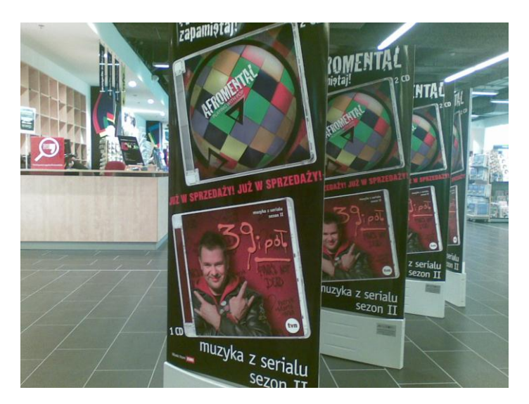
Advertising banner of the album released by Afromental and soundtrack of 39 and a half in Empik, Wrocław, Renoma Shopping Centre, 2009

The second season of 39 and a half focused on the band Afromental, which promoted its album during the broadcast using the series: the band gave concerts together with the Dirty Track (in the represented world and outside it), recorded video clips and met with fans. There was promotional feedback between 39 and a half and Afromental, evident in the actors of the series appearing in the video clip of Radio Song. They played characters that resemble characters in the series (e.g., the unhappy, effusive boss of a record company phonographic company and her submissive secretary; a couple of lovers; a provocatively dressed, attractive student). Enacted scenes in the video clip are based on the themes of the series (e.g., the band cannot live up the record company boss's standards; the young couple is going through a crisis; the attractive black-haired woman charms the opposite sex)<sup>14</sup>. In the process, the video clip becomes a continuation, or rather a complementary, secondary, coherent with the series' narration. The band, situated in the centre of the video clip, is closely integrated into the represented world in which it is promoted for several months. These hybrid promotional activities were also reinforced by the joint promotion of the second season's soundtrack album and the album by Afromental Playing with Pop, which was available for sale in Empik stores, among others.