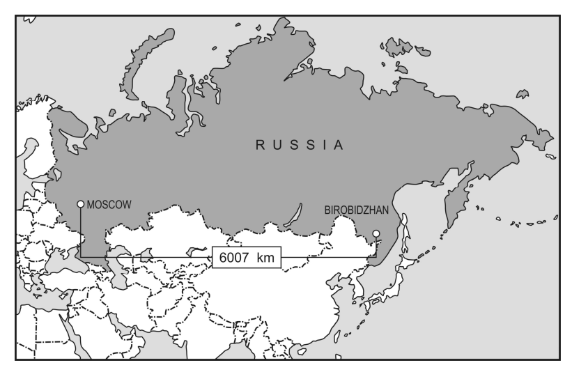
Fig. 1. Distance between Moscow and the JAR

anti-Semitism before and after World War II, destructions of libraries<sup>4</sup>, the fall of communism and Birobidzhan's continued, renewed existence and the revival of Jewish life in the post-Soviet JAR are not only a curious legacy of Soviet national policy, but after the break-up of the USSR and the religious worldwide rebirth, represent an interesting case-study in order to examine some geographic problems and interethnic relations.