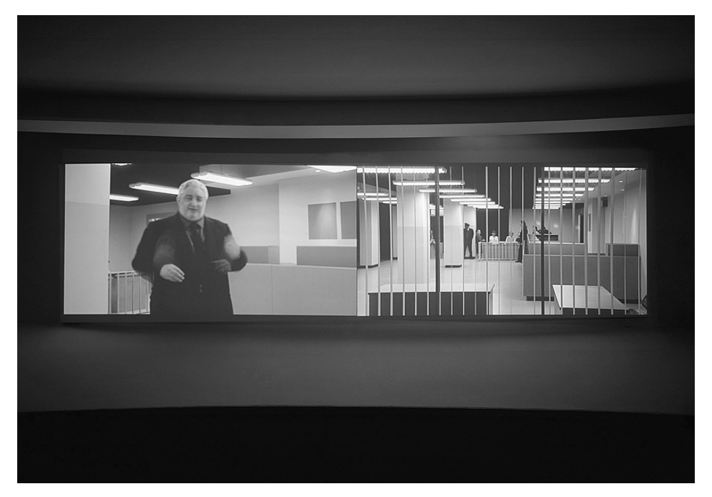
Figure 1. The Third Memory, 2000