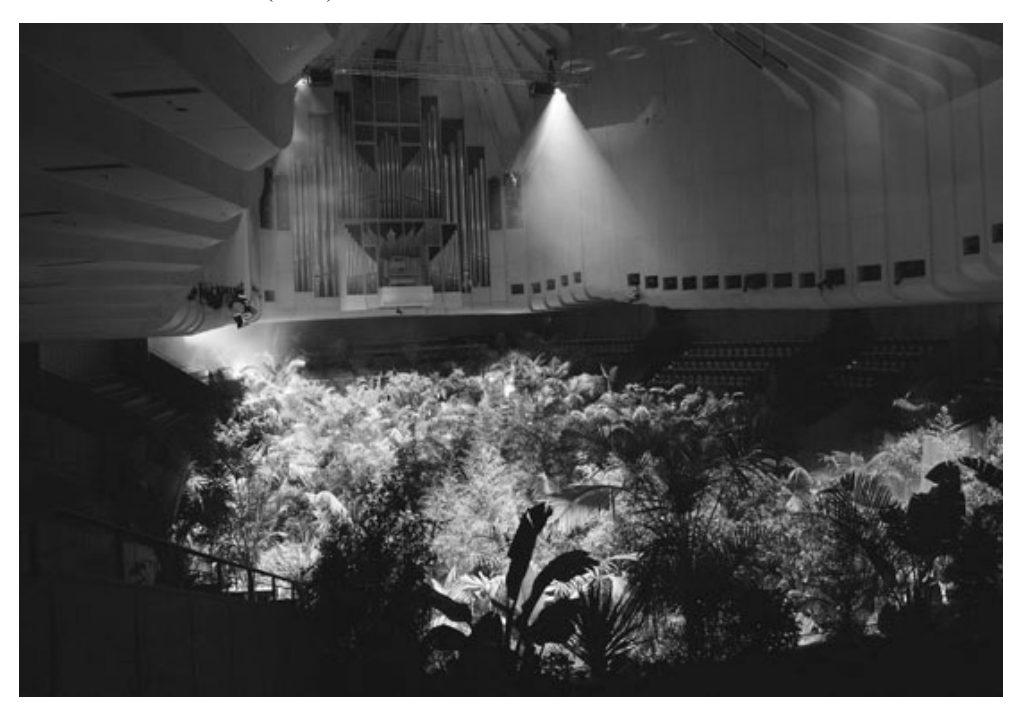
Figure 4. A Forest of Lines, 2008