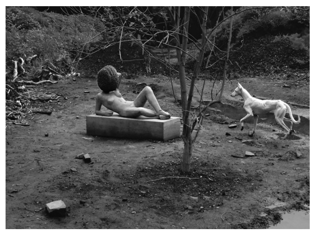
Figure 2. Untilled (2012), Documenta 13; Kassel