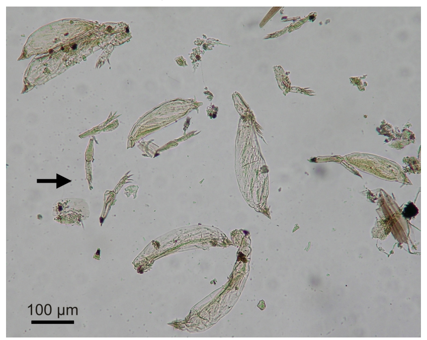
Fig. 1. Hesperomyces virescens thalli removed from the elytron of Harmonia axyridis from Divna. The arrow shows a group of thalli without perithecia.

The distribution of H. axyridis in Croatia, based on the records reported by Mičetić Stanković et al. (2011), Ivezić et al. (2011) and this paper, is shown in Fig. 2. Our records from Pelješac Peninsula are about 85-90 km SE of the town Sinj, the southernmost place in Croatia so far reported as a locality of H. axyridis (Mičetić Stanković et al. 2011).