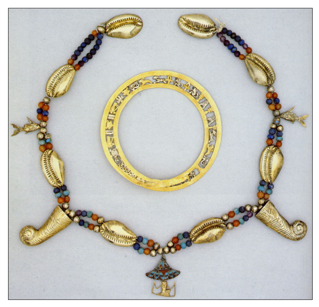
Fig. 4. Amuletic girdle with cowrie shells imitated in electrum, Twelfth Dynasty, Egypt (After Andrews 1994, Fig. 69; courtesy © Trustees of the British Museum)

goldsmiths also occasionally put bits of metal into the hollow parts of the cowrie imitation, causing a jingling, rattling sound when the wearer moved. The imitations were generally made of precious stones, artificial materials and metals of far greater value than the shells themselves. For the Egyptians, gold and silver had added symbolic meaning: gold was linked to the sun and was symbolically