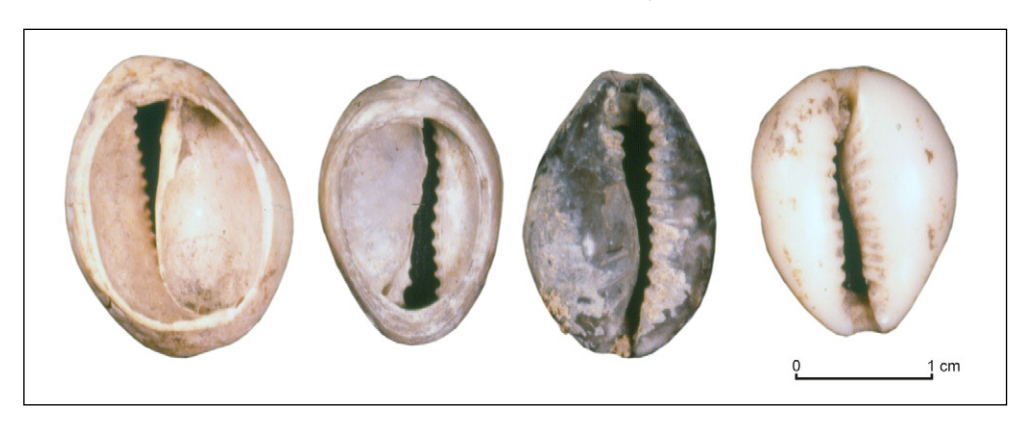
Fig. 1. Cowrie shells with cut off or ground down dorsum

During the Bronze Age, cowries became more common as grave goods, usually associated with burials of women and children (Kovács 2008: 17). They were also popular in predynastic Egypt and also in the southern Levant of the Bronze and Iron Ages (see Bar-Yosef Mayer 2007: Table 18.3). For example, cowrie shells comprised a third (128) of all the shells recovered from excavations of Iron Age II levels at Kadesh Barnea (10th-7th/6th centuries BC). Of these, a fourth were found modified with their dorsum removed (Bar-Yosef Mayer 2007: 280–281), indicating that the modification of the shell was of importance and may have been practiced at the site itself. In Egypt, cowries were found in graves of young girls from predynastic times (Reese 1991: 189) and in the southern Levant modified cowries were discovered arranged around the skull in female burials, e.g. at Tomb 201 from the 10th-