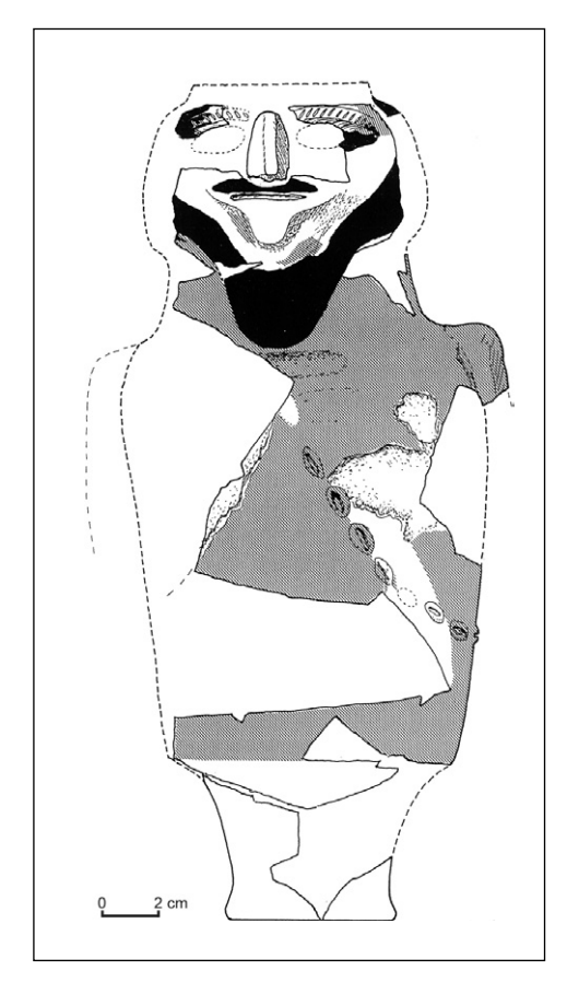
Fig. 3. Bearded worshiper from Horvat Qitmit in Israel with a string of cowries (After Beck 1995: Figs 3.16–3.17, 3.19–3.20; courtesy of the Institute of Archaeology, Tel Aviv University)

The importance of cowries extends throughout the Fertile Crescent as noted in Neo-Assyrian records that specifically mention cowrie shells alongside precious items, as well as silver and gold (e.g., Fales, Postgate [eds] 1992: 66, 68, 72, 118, 129). Such texts highlight the cultic and religious importance of cowries, as well as their economic value expressing status and wealth.