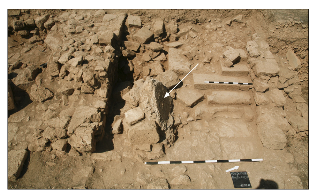
Fig. 10. Western staircase 28N with a fragment of collapsed basin floor tipped over from a podium south of it