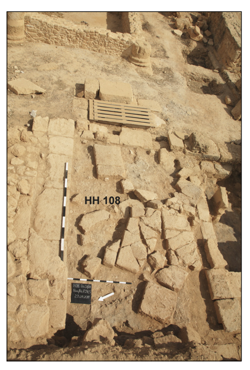
Fig. 9. Room 28S: lowest remaining level of disturbed pavement, wall and southern part of podium; southern and central part of courtyard 13 with remodelled tetrastyle impluvium in the background

The paving in room 28S (HH108), situated north of heating area 32, was very disturbed, most probably by an earthquake, with broken and displaced slabs resting in two layers and standing on end [Fig. 9]. A massive masonry wall north of this pavement, together with the south wall of stairwell 28N, supported a platform made of packed, medium-sized unworked stones (S.6/11) and accessible by steps. This structure seems to have supported