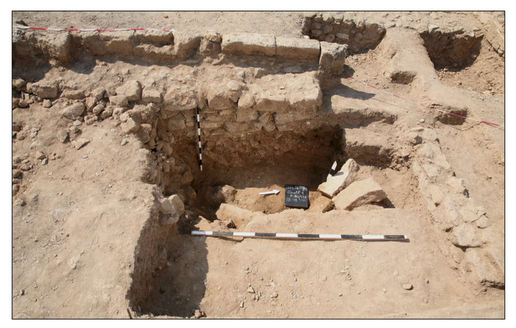
Fig. 13. Foundation of the stylobate of the western courtyard peristyle ('Hellenistic House'); note the shallow foundation and fragments of railing below

Apart from these main areas of exploration, limited cleaning for the purpose of rectifying the documentation was conducted in the eastern part of the so-called Hellenistic House.<sup>2</sup> One area was a threshold leading from street A', on the south, to a small courtyard 8E, and another was a hollow between rooms 8E and 15. Limited work was also undertaken in the Late Roman street between the Villa of Theseus and the House of Aion, and in room 7 of the latter.