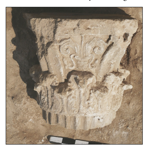
Fig. 12. Corinthian capital from the main courtyard of the 'Hellenistic House'

Above the final usage level of the courtyard, a Corinthian capital was uncovered, almost exactly matching one