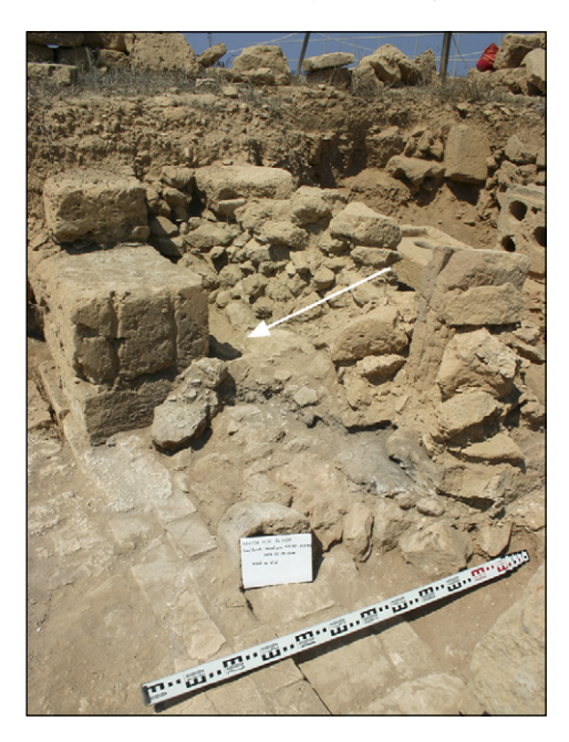
Fig. 6. Inside of a hot-air channel with ash deposit on the floor (arrow)