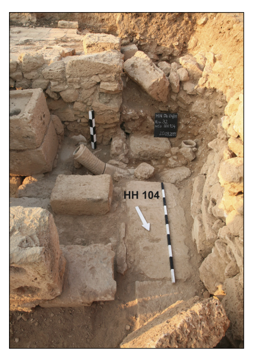
Fig. 8. Western edge of heating area 32: reused siphon and water pipes. In the background, a heating channel abutting the west wall of the complex, now dismantled

however, was not found. A source of heat located west of the building, in street 10, seemingly suggested by the direction of the channel, has to be ruled out, as the channel walls (HH102 and HH103) were clearly set against the west wall of the building (HH104, presently robbed out) rather than cut across it [Fig. 8]. At the eastern end of the channel, an oblique slit in a masonry pillar directed the hot air into the hypocaustic space of room 27. A previously entertained hypothesis concerning the existence of a vertical channel in this masonry pillar had to be abandoned, as the oblique channel proved to have a solid stone