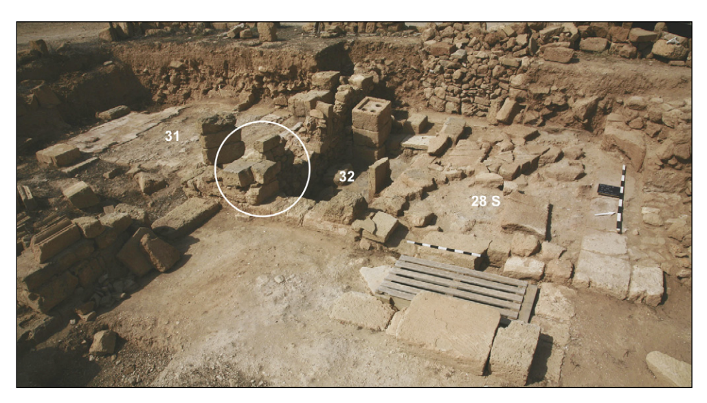
Fig. 5. Southwestern part of the so-called Hellenistic House with hypocaustic floor in room 31, heating area 32, and heavily disturbed pavement in room 28S