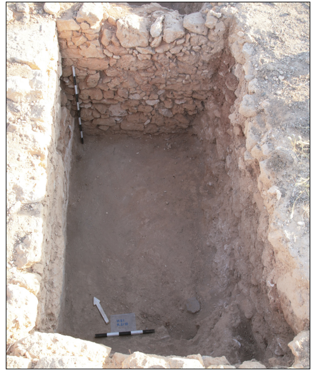
Fig. 2. Room 31 (Villa of Theseus) robbed out flagstone pavement under probable second podium