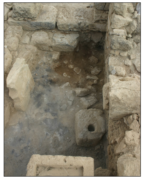
Fig. 7. Eastern part of heating area 32 with remains of thick ash and soot deposit abutting stairs leading to courtyard 13