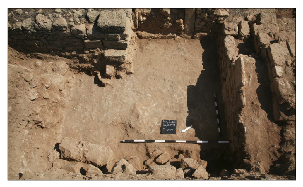
Fig. 11. Room 33 of the so-called Hellenistic House, situated below the southwestern corner of the Villa of Theseus