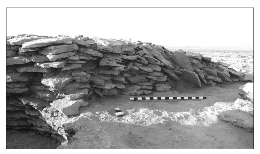
Fig. 3. Tumulus SMQ 49: southern section of the northwestern quarter, view from the north