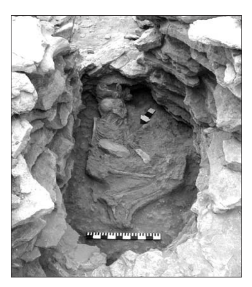
Fig. 5. Bottommost burials in the grave chamber, view from the northwest

In the earliest phase, articulated skeletons of at least six individuals (primary burials) could be identified: four adults, male and female, and two children. The dead were buried in flexed position on the right or left side, aligned with the long axis of the chamber, the head toward the northwest or southeast [Fig. 5]. Two double burials were deposited in the chamber; in both instances it was a burial of a woman and