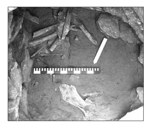
Fig. 6. Tumulus SMQ 49: Secondary burials from phase 2 in the grave chamber; robber's pit is in the central part of the chamber where some equid bones can be seen, view from the northwest

Skeletal remains from the second phase represented also at least six individuals: five adults, both male and female, and one child. No anatomical relations between the bones were recorded; they had been intermingled and broken already in antiquity. Some of the long bones were stacked up over the skulls [Fig. 6], indicating that at least some