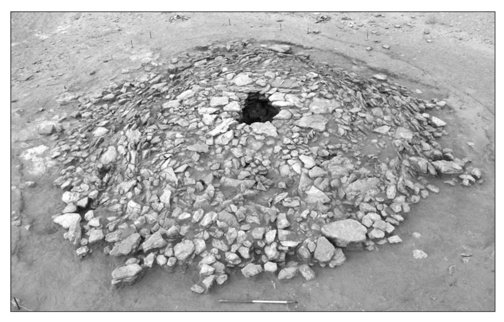
Fig. 4. Tumulus SMQ 49 after removing the sand cover, during exploration of the grave chamber, view from the northwest