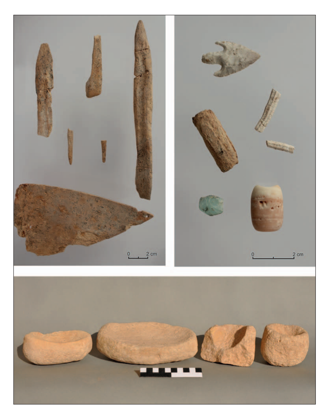
Fig. 7. Collection of artifacts made of animal bones (top left); personal ornaments and flint arrowhead (top right); ground stone tools from around the perimeter of the mound (bottom)