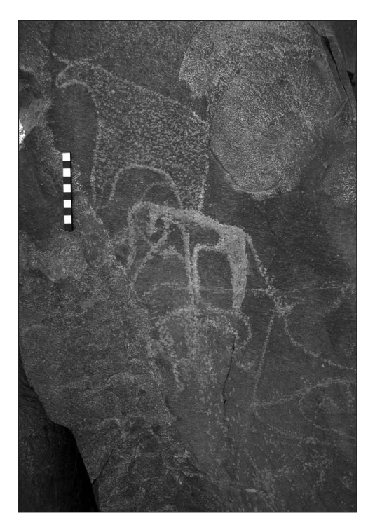
Fig. 5. Keheili 5: panel depicting cattle

A brief survey of the Keheili region recorded petroglyphs on another massive granite hill (around 30 positions with rock art). The pictures executed on vertical rock surfaces form a kind of rock-art gallery [cf. above,