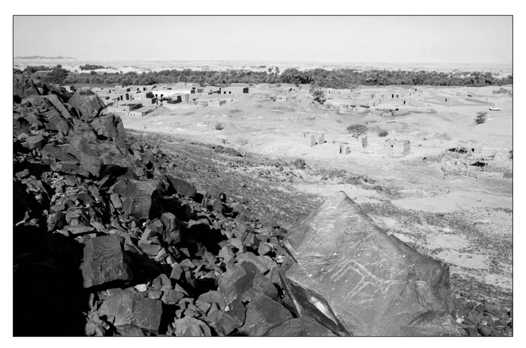
Fig. 3. El-Gamamiya 67, view of the eastern side with the village in the distance

pecked in outline, sometimes treated additionally with a single or double vertical line and in a few cases with dots or rubbing forming a variety of figures [cf. Fig. 4]. The legs are represented almost canonically two lines joined at the bottom — but not so the horns, which demonstrate several possible variants. They are mostly long. Their shape reflects both natural and intentional deformations, including single crooking, closed or almost closed oval forms, lyre- and heart-shaped examples [cf. Fig. 4]. Most frequently they are curved up in an arch. Some form of pendant suspended from the neck is shown in a few cases, while depiction of the udder is more frequent. Cows with calves were also shown in some cases [Fig. 4, bottom right].