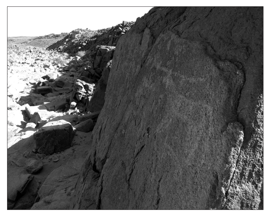
Fig. 2. The wadi in the Gebel Gurgurib area, looking north