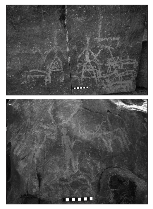
Fig. 6. Keheili 5: panels depicting humans and cattle (no. 20a, top, and no. 19)

Fig. 3 on 399]. Themes here cover a range of pecked and incised cattle images, in a few instances associated with human figures [ Figs 5-6]. The animals feature angular and irregular body shapes. Long horns take on a