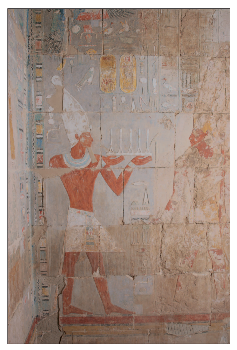
Fig. 1. South wall of the chamber with an image of Hatshepsut making offerings to Amun, during conservation and restoration