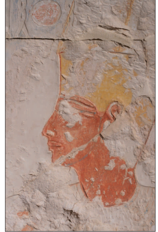
Fig. 2. Close-up of a representation of Amun, before (left) and after restoration