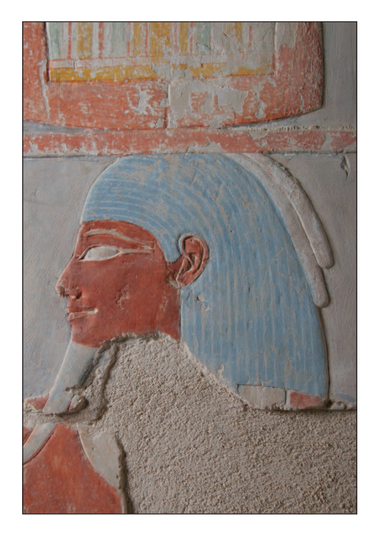
Fig. 3. Polychromy on the royal ka, after restoration

At the time when parts of the temple were adapted for use in the Coptic monastery of Saint Phoibammon, the