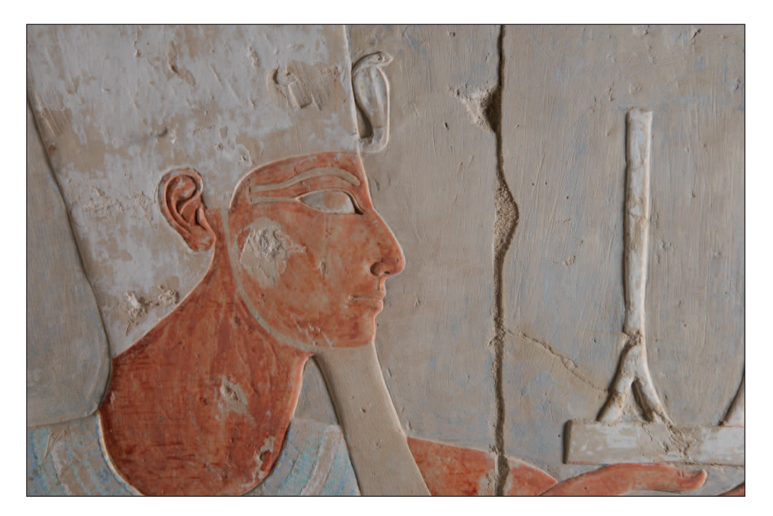
Fig. 4. Figure of Hatshepsut, close-up after restoration

preserve the post-Amarna mineral plaster reconstructions. A similar problem faced restorers working on the restoration of the Northern Chapel of Amun in the 2004/2005 season. The findings and conclusions resulting from that project were instrumental in developing the best conservation approach for the current work. The extension and the depth of the detachment were carefully checked by tapping the plaster layer. Surface tension was reduced by injections of ethyl alcohol mixed with water (1:1) which were applied into the empty pockets between the plaster and stone. The first phase of consolidation was achieved by injections of a water dispersion of acrylic resin PRIMAL AC33 (by Rohm&Haas). Once plaster adhesion reached optimal levels, the mineral components were reinforced. The weak and