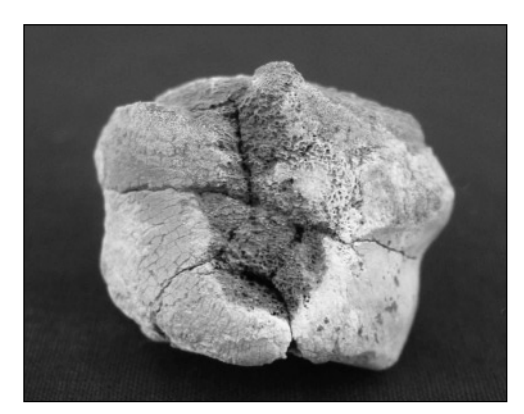
Fig. 5. Cuts visible on the diaphysis of a cattle long bone