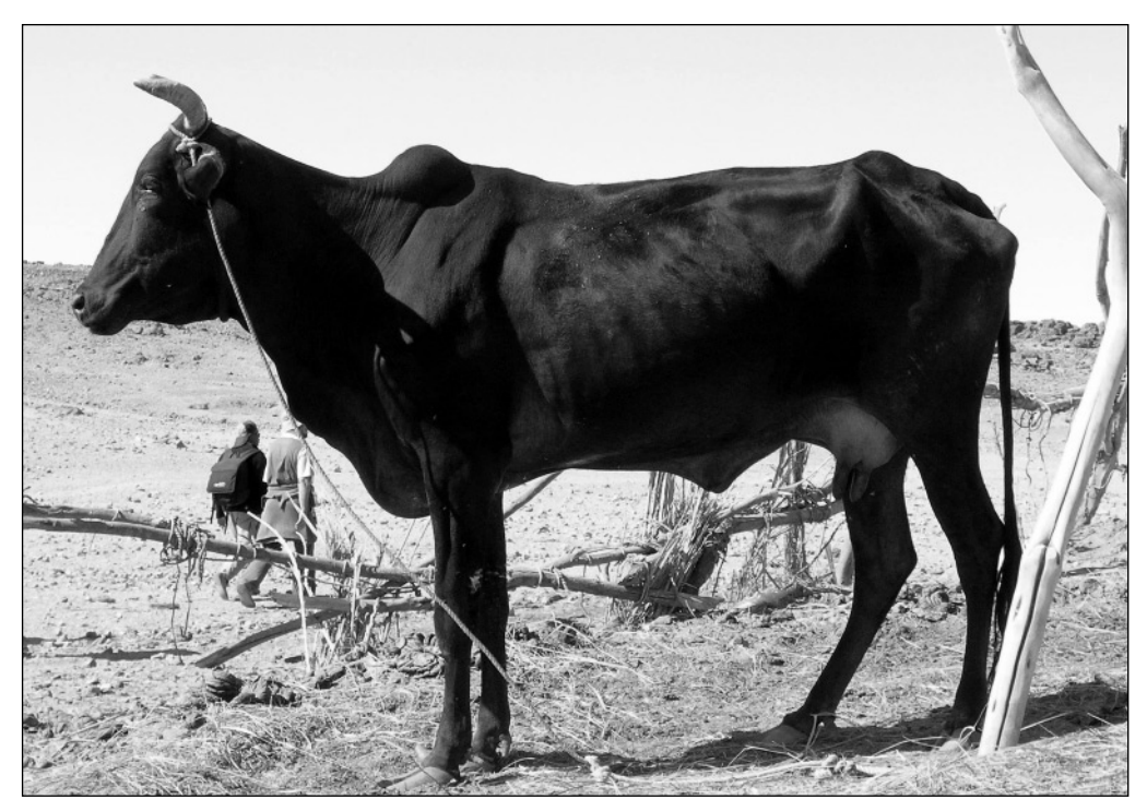
Fig. 6. Modern short-horned variety of cattle (zebu) bred in northern Sudan

Animal varieties in the three assemblages did not demonstrate any differences: Sudanese Nubian variety of goat, thin-tailed Sudan Desert variety of sheep, and longhorned African cattle with a smattering of the still rare short-horned variety. The small ruminant varieties are the same as modern ones, but distinctive as regards horns, hornlessness being increasingly common today for male as well as female individuals. A major difference is noted, however, with respect to cattle varieties. Cattle from the Christian faunal assemblages are characte-