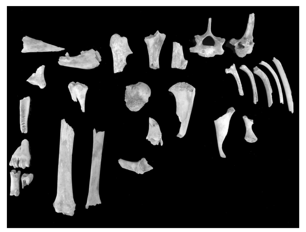
Fig. 1. Selection of faunal remains from the SW-E sector of the monastery site in Old Dongola (Kom H)

represented, the assemblage from the monastery is the poorest. In the palace structure at Dongola and at Banganarti, remains of birds, fish and mollusk were also noted, none of which were found at the monastery (Osypińska 2004a; 2004b). In the species percentage share, the material from the monastery could be likened to that from Banganarti: 58% small ruminants in the monastery and 49-59% depending on the assemblage in Banganarti. At the palace in Dongola, these species in an analogous period constituted 37% and 19%. On the other hand, the cattle percentage was much higher in the material from the monastery (35%) compared to that from Banganarti, where it oscillated between 25% and 27%.