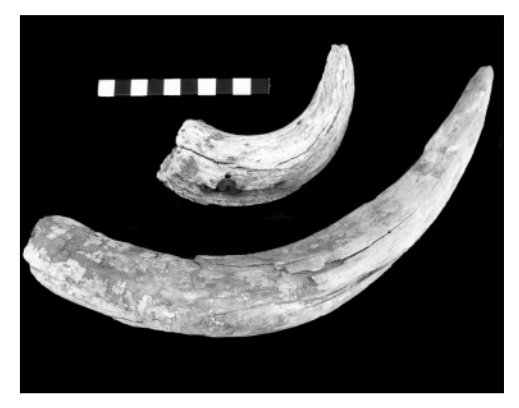
Fig. 4. Examples of short- and long-borned cattle horns from the Old Dongola monastery site