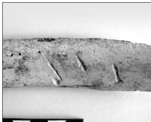
Fig. 14. Cutting marks on camel costa bone