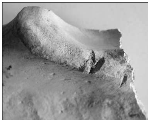
Fig. 13. Chopping marks on camel pelvis bone

The burial had been furnished with grave goods in the form of the meat of a lamb about five months of age, a young sheep and a juvenile camel. The carcasses had been butchered along body parts, retaining as an offering the most attractive cuts from the consumption point of view. The deposited meat comprised the right side of a lamb, left of a sheep and parts of both sides of a camel. It should be noted that the camel and sheep remains were deposited in different