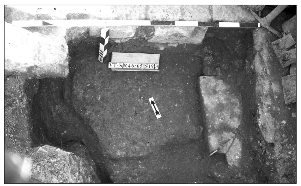
Fig. 2. Threshold of a door under R. 46 (trench K/9-10)