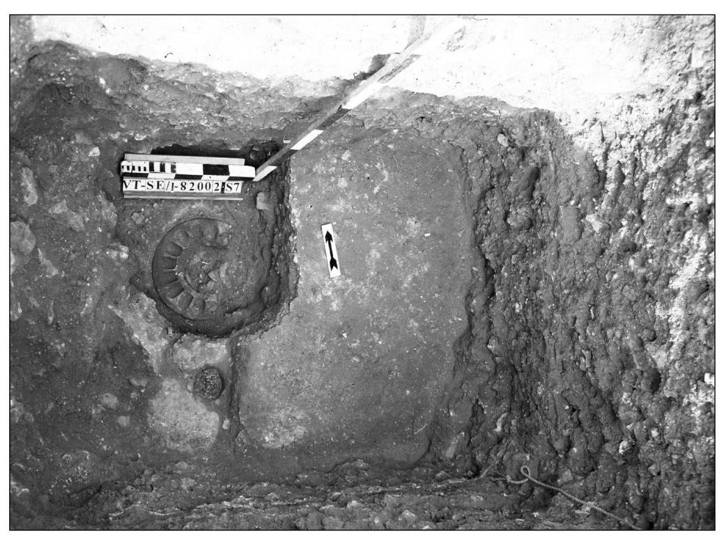
Fig. 4. Fluted pedestal incorporated into an early Hellenistic floor (trench I/8)

bottom was constructed at 1.05 m. The basin was cut into a sequence of three floors.<sup>11)</sup> These floors were separated by a thick clayey fill from another, lower sequence of two floors, the material between which belongs to at least the 3rd century BC.<sup>12)</sup> The lower of these is separated from the upper by a layer of burnt organic matter containing relatively large quantities of little broken pottery. A corresponding floor was uncovered just