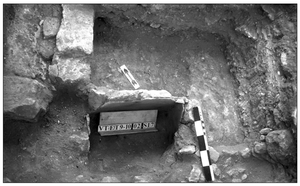
Fig. 3. Settling tank under Room 73W (trench \Gamma /9-10)