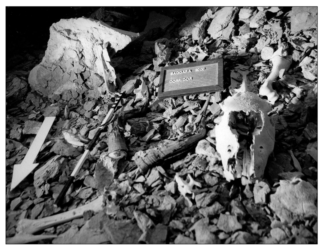
Fig. 2. General view of the assemblage in Corridor 1

The presence of two pigs ( Sus scrofa ) in the assemblage is also very peculiar. Two crania intact with the maxillae, one belonging to an old pig (the M3 and C were very worn down; the M3 was almost flat), and the other to a young pig (about 25 months old, based on the dentition), were recovered from the deposit. The juvenile animal was part of the circle, while the older beast was found, together with a catfish head, near the entrance of the chamber. It appears that these two