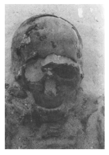
Fig. 2. Face of the skull of Burial 14 showing the swab in the left eye socket and linen preserved on the skull.

In the opinion of L. Bareš it might have been a case of cutting up the body and its fixation with the aid of sticks for fear of return. Such a practice he calls "vampirism".8