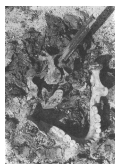
Fig. 3. Wooden stick placed inside the hole (foramen magnum) at the bottom of the skull.

the death of the two persons. It is not clear, however, whether the cutting up of the bodies of the two men occurred after their death.