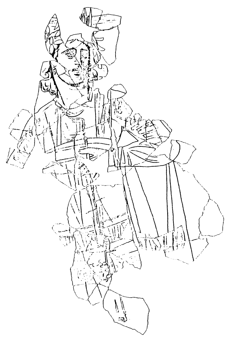
Fig. 2. House of Aion, Room 7. Reconstructed fragment of painted wall decoration.