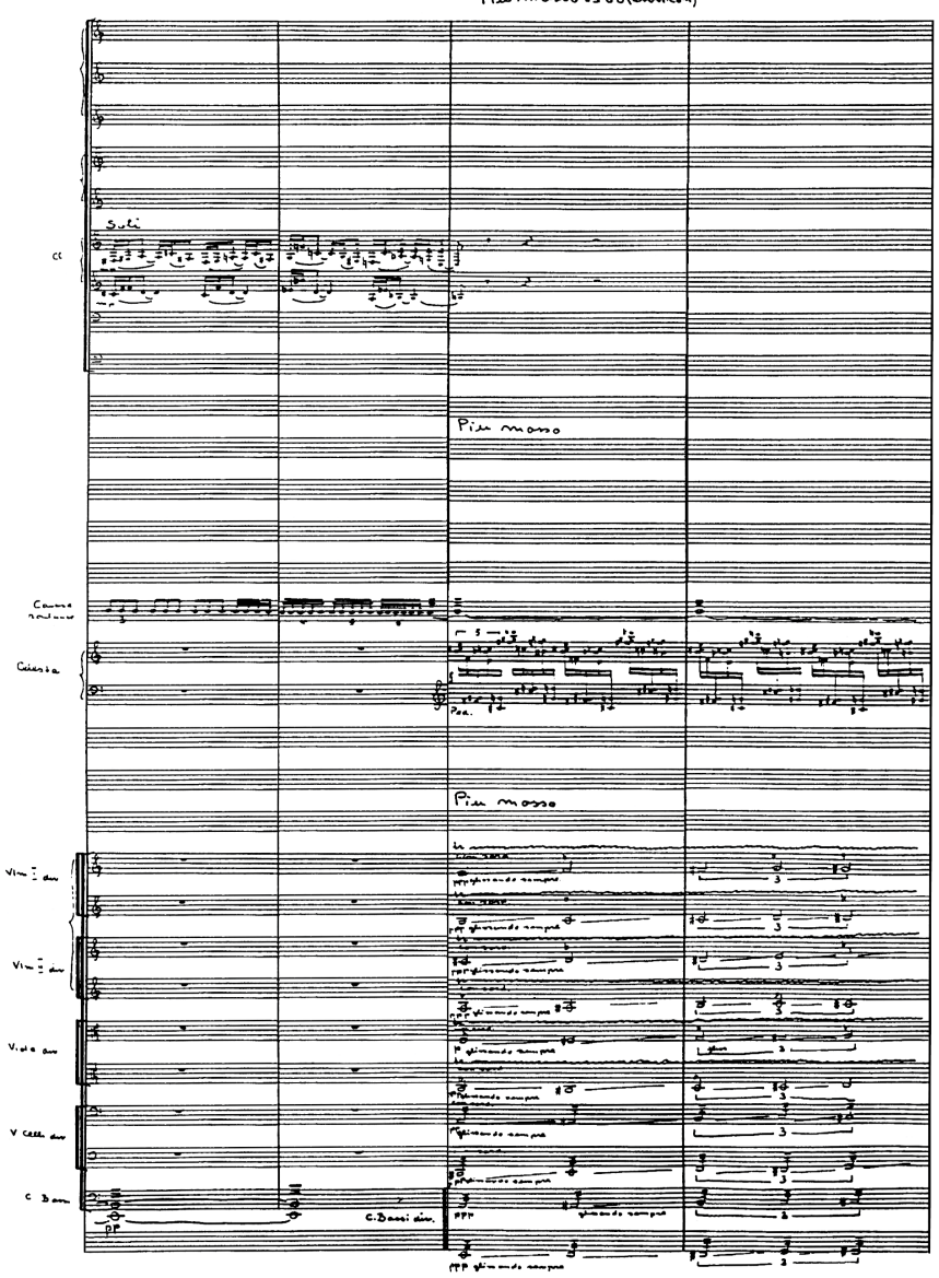
2 groma conez szylezym strumieniem, beczka napetnia się winem] Piu morso 1 = 88(emizen)