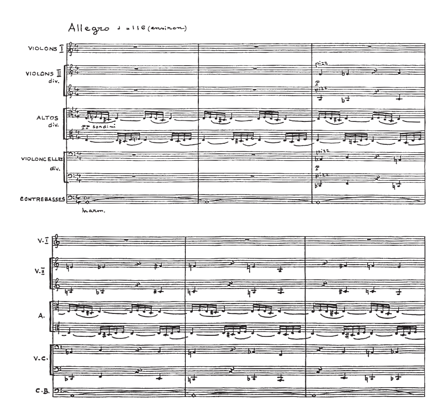
Figure 3.6 Antoni Szałowski, Music for strings, first movement. Allegro, first theme, bars 16–18, beginning of section "b"

In summing up this brief sketch of the work of Antoni Szałowski, which converged with the "actual Neoclassism" <sup>21</sup> of the school of Nadia Boulanger, <sup>22</sup>