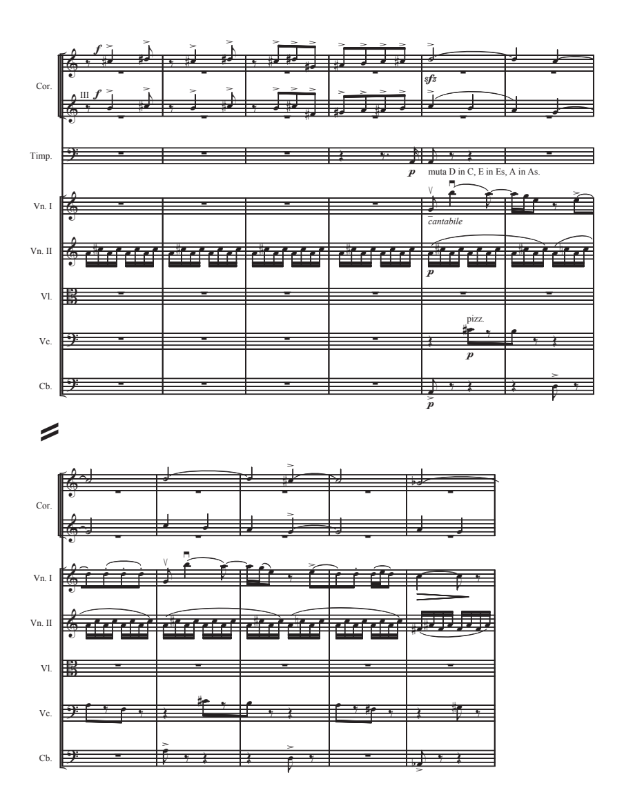
Figure 3.2 Antoni Szałowski, Overture, second theme, No. 10 in the score, brass instruments, kettle drums and strings