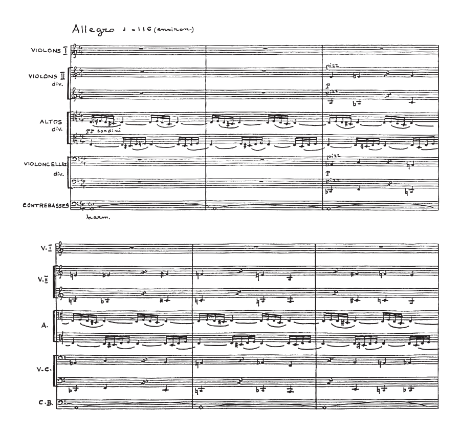
Figure 3.5 Antoni Szałowski , Music for strings, first movement. Allegro, first theme, bars 1–6, beginning of section "a"

strates that this composer still awaits his place in the musicological literature and the history of Polish twentieth-century music. That is the point from which the significance of his legacy "ought to radiate, regardless of all the convolutions of his artistic and life paths" (Mycielski 1973: 3).