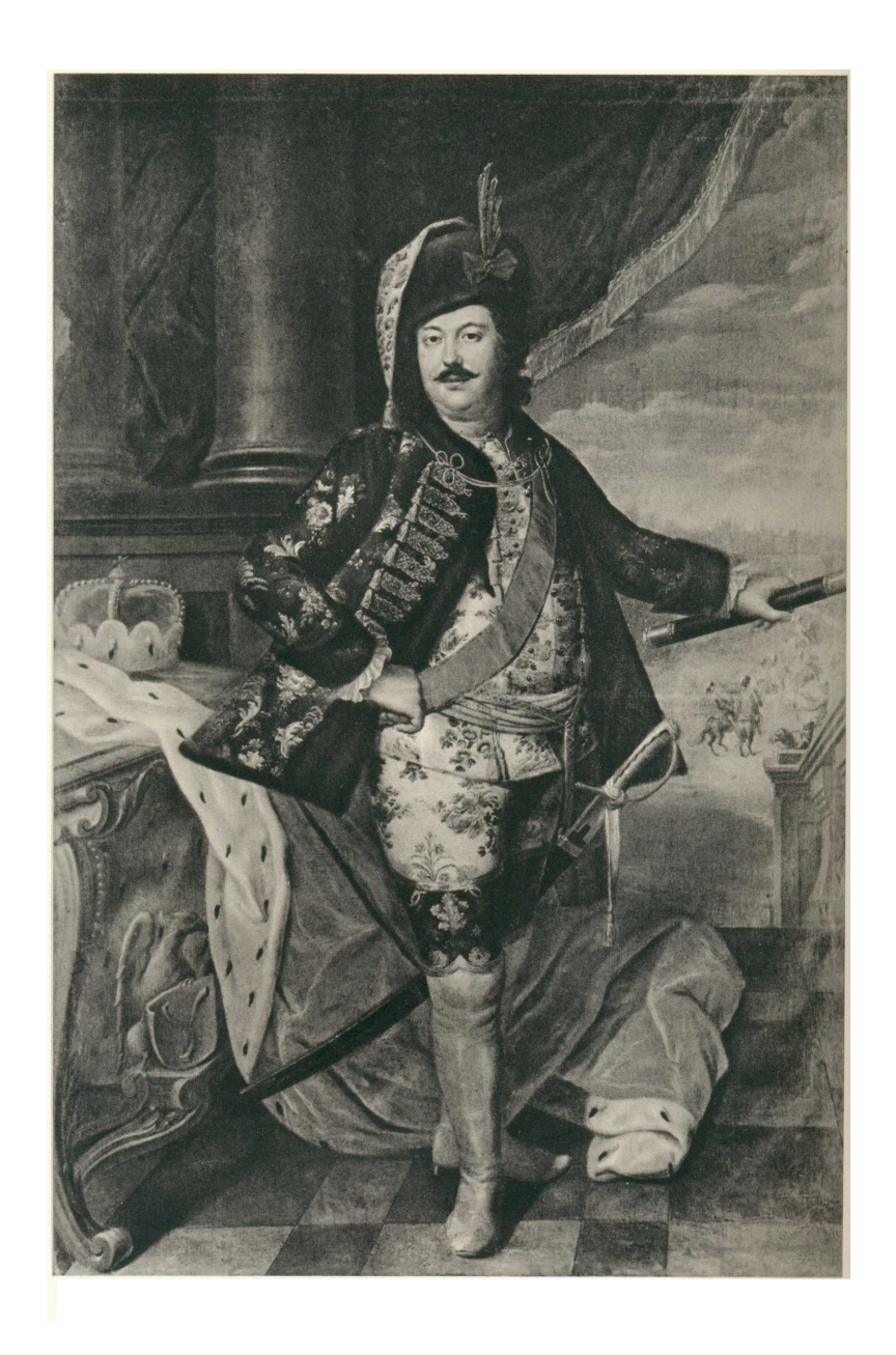
Figure 4.1 Jakub Wessel, Portrait of Hieronim Florian Radziwiłł, around 1746, oil on canvas, 215x141~\rm cm , inventory No. MP 2436, holdings of the National Museum in Warsaw