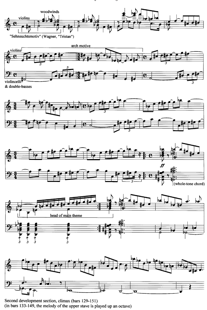
Fig. 1.5. K. Szymanowski, Symphony\ No.\ 1 , first movement, climax of the development.