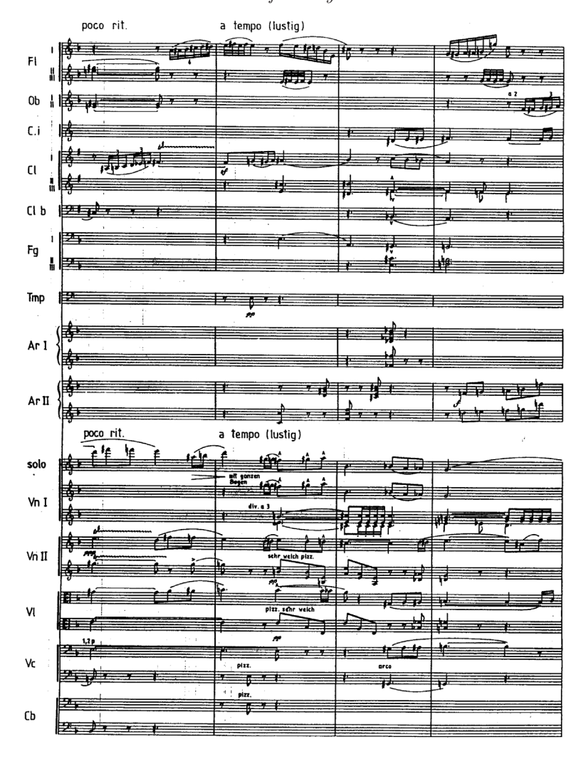
Fig. 1.7. K. Szymanowski, Symphony No. 1 , third movement, waltz episode (bars 11–15) (copyright PWM 1993).

It is preceded by an entry of the solo violin (bars 7–13) which anticipates the solo beginning of Szymanowski's Second Symphony (it is not by hazard