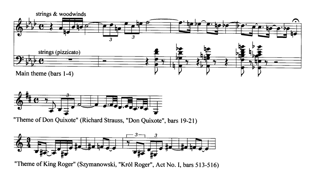
Fig. 1.1. K. Szymanowski, Symphony No. 1, first movement, main theme compared with two similar themes.

In the first movement of his First Symphony, Szymanowski chooses the 'Classical' sonata form, but (just as Witold Maliszewski<sup>15</sup>) renounces the convention of the slow introduction and begins immediately in fast tempo ( Allegro pathétique <sup>16</sup>) with the main theme. This theme has been called 'Straussian' because of its rather complex structure consisting of several motives with different rhythmical values.<sup>17</sup> Admittedly, the theme of the protagonist in Richard Strauss' tone poem Don Quixote (1897) also shows a rising triplet motive followed by a descending chromatic line (see figure 1.1).