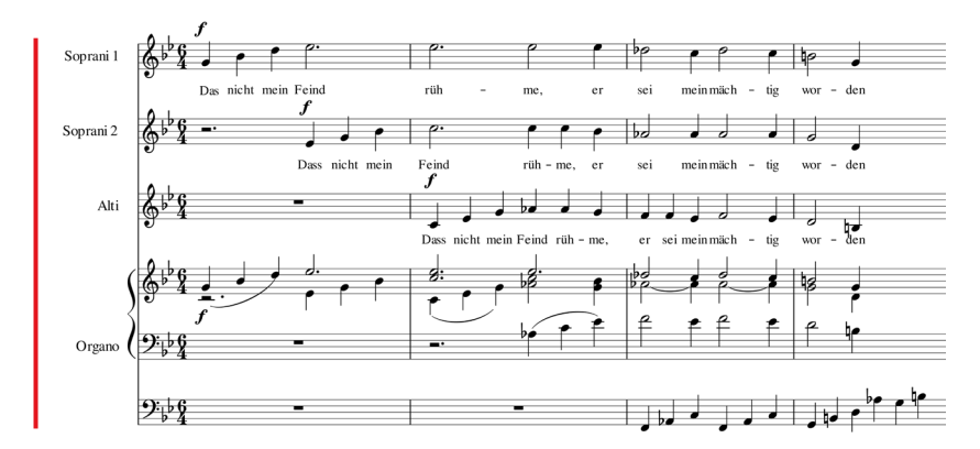
Ex. 9: J. Brahms, Psalm XIII Op. 27, bb. 60-63. Maniera distendente.

The musical arrangement of the last two verses of the psalm of a clearly positive expression is characterised mainly by the change of the key into major (from earlier dominating G minor), which from the perspective of the musical rhetoric can be interpreted as mutatio per modum aut tonum .<sup>34</sup> The part of choir, led majestically, in the equal rhythmic values and without rapid contrasts, is supported by the this time individual part of organ, imitating the chords typical for the harp in its texture (in accordance with the figure assimilatio ; Example 10)—the instrument of the Biblical origin, appearing in the Old Testament in the context of the joyful character or the thankful psalms.