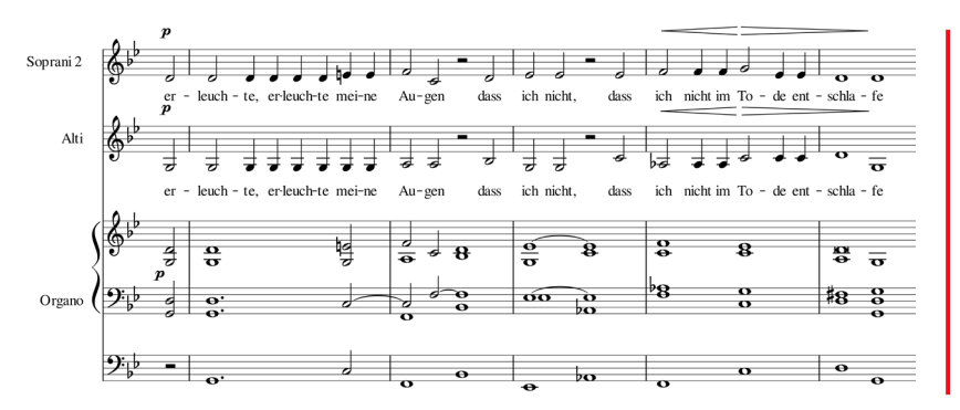
Ex. 8: J. Brahms, Psalm XIII Op. 27, bb. 55–59, the part of second soprano, alto and organ. Figures: anabasis , hypotyposis .

With the repetition of the text from the third verse in the following bars of the work, Brahms uses the analogical techniques: the word "erleuchte" determined the ascending melodic line of the second sopranos, finishing with the cadence in the major key (this time in F major), and the already mentioned "sleep of death" is illustrated by the composer through "waving" shape of the bass line in the part of organ<sup>32</sup> (Example 8).