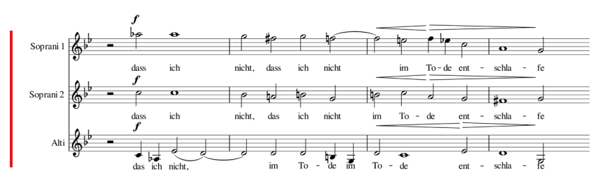
Ex. 7: J. Brahms, Psalm XIII Op. 27, bb. 51–54. Figures: pathopoeia, passus duriusculus, hypobole .

The words telling about "the sleep of death" ("dass ich nicht dem Tode entschlafe") are treated by the composer in a totally different way—their negative meaning is underlined by the use of the figure katabasis in altos, pathopoeia in the first sopranos and passus duriusculus in the second sopranos. Moreover, in the part of alto the lowest sounds of the register of this voice are achieved ( hypobole ; Example 7).