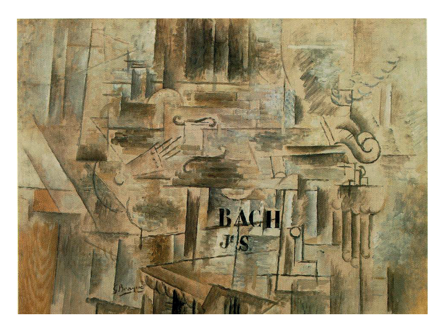
Illus. 3: G. Braque, Hommage à Bach (oil on canvas, 1912).