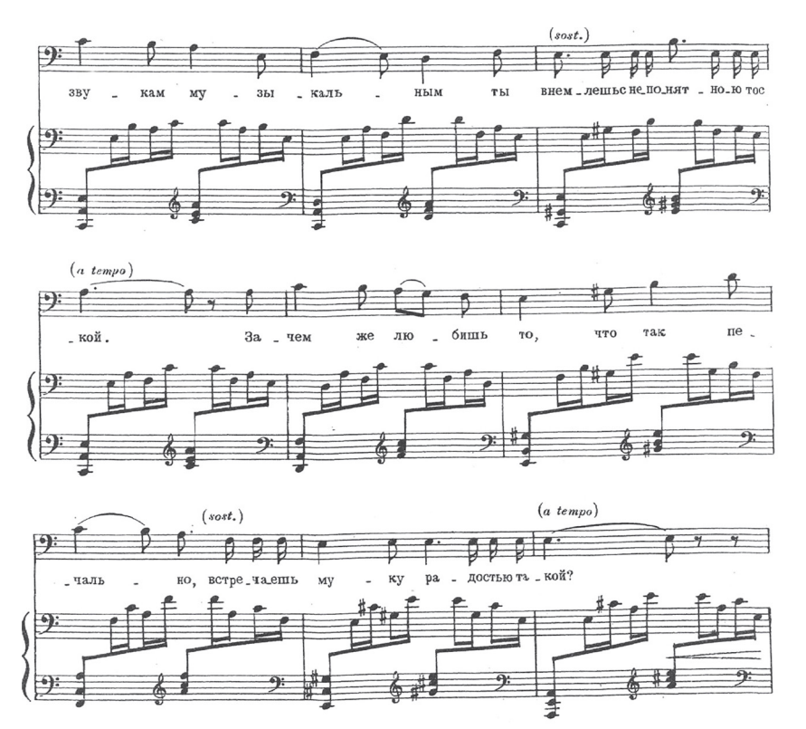
Ex. 1: D. Kabalevsky, Ty-muzyka , ( You-music ) from the cycle 10 sonnets by Shakespeare op. 52, bb. 3–11.

what emphasizes the oxymoronic meaning of the text—music symbolizes joy and suffering at the same time (Ex. 1). A particular kind of musical narrative accompanies the verses of stanza II, where drama is even more deepened than in the musical elaboration of the final stanza. Accompaniment, turning into a low, gloomy register, becomes austere, maintained in chords, and vocal part begins to sound less like singing, and more like expressive recitative. This change of character can be attempted to translate as a desire to emphasize the rhetoric of the text, but it appears that it results more from the overriding need for musical contrast than from the content of sonnet itself. Although menacing warning at the end of Sonnet VIII does not lose anything in the Russian translation, Kabalevsky presents it more in character of moral that the culmination point.