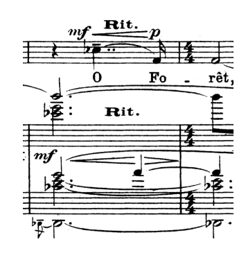
Ex. 5: A. Caplet, Fôret, b. 30.

The use of the acoustic scale as harmonically and texturally representing the forest could be further affirmed in bar 30, where the poet addresses the forest directly once more. The wide-ranging chordal texture appears as the poet mentions the word "forest", and the Db acoustic scale returns at this precise point.