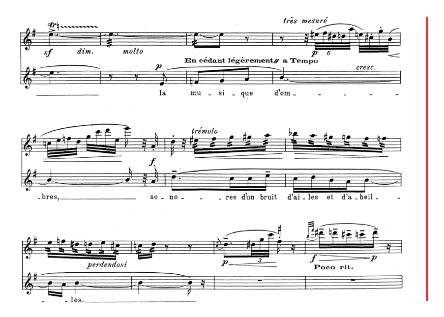
Ex. 6: A. Caplet, Écoute , bb. 50-59.

Écoute allows the virtuosic quality of the flute to be fully explored. There are passages where the flute is unaccompanied by the voice, allowing a full evocation of the sights and sounds of nature. For example, in the flute solo in bars 20–31, there are three collections, stating three different textures through which the music passes. As Example 7 shows below, the first collection (bars 20–22) is almost whole tone except for the F \ \ . Then there is a chromatic pattern in bars 24-25, after which an E trill leads the music to an E phrygian collection beginning at bar 26. The textures of these collections could represent the swirl of the wind through the whole tone flourish, the buzzing of the bees through the sharply chromatic staccato and trill textures, and the gentle song of the wildflowers through the flowing E phrygian scale.