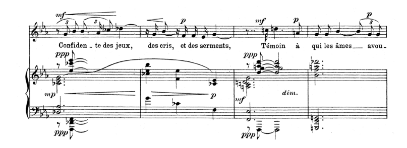
Ex. 4: A. Caplet, Fôret , bb. 8-11.

The use of the acoustic scale as harmonically and texturally representing the forest could be further affirmed in bar 30, where the poet addresses the forest directly once more. The wide-ranging chordal texture appears as the poet mentions the word "forest", and the Db acoustic scale returns at this precise point.