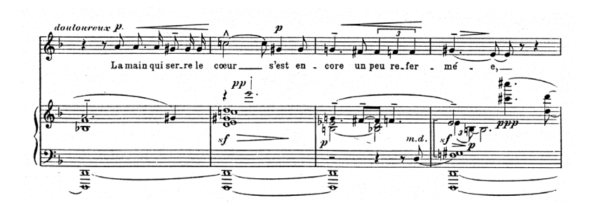
Ex. 1: A. Caplet, Détresse, bb. 10-13.

The text, "The hand that squeezes the heart has again tightened", suggests a painful situation becoming further distressing as painful pressure seizes the heart. The pp chord over the word coeur ("heart") is outlined by the D locrian-natural-two, but upon moving to the end of the line as the poet describes the tightening sensation, the music transitions to D octatonic. Perhaps the pp dynamic at the locrian-natural-two point helps musically reflect the fragility of the heart, as the sf dynamic over the octatonic chord reinforces the painful clutch. The fully diminished nature of the octatonic at this point serves as a musical affirmation of the ache the poet feels at this stage.