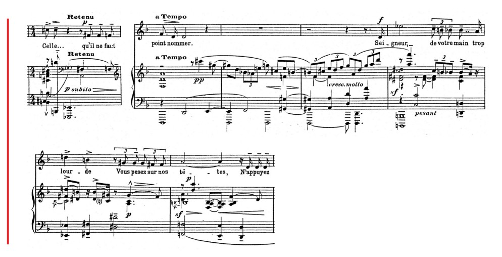
Ex. 2: A. Caplet, Détresse, bb. 25-31.

Further to the juxtaposing of the locrian-natural-two and octatonic modes, the use of the octatonic scale is so embedded into the fabric of this piece that it is possible to suggest a link between the root tones of the octatonic scales and the overall key of the song. The triad (including major and minor seventh) of this key is D minor: D F A C/C#. Except for A, Caplet uses each of these tones as root tone building blocks for the octatonic scale as it returns throughout the piece. The interpretation of the diminished nature of the octatonic scale as an essential component of the harmonic fabric aligns with the theme of anguish as an essential component at the core of the poem. Caplet's use of the octatonic mode musically represents his recognition of Charasson's literary intent, and this is heightened when juxtaposed with the half-diminished form of the locrian-natural-two mode.